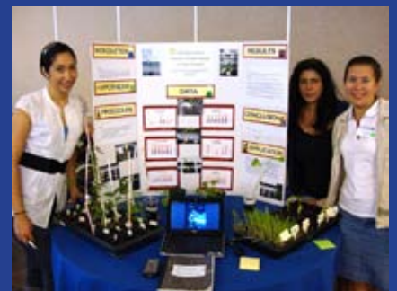
Earth Systems Science project