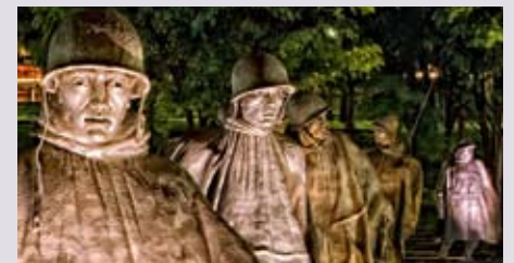
Korean War Memorial

A new Teaching American History, five-year grant has been awarded the CENTER, along with Gateway Regional Schools and other partners.