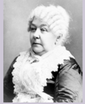
Elizabeth Cady Stanton

Seneca Falls, NY – the birthplace of the Women’s Rights Movement – was the travel destination for the year two kick-off of the Visions of Liberty and Equality (VLE) Teaching American History program. This year’s theme is Women’s Rights from the Colonial through the Modern Era . Thirty-two K-5 educators spent three days in July touring numerous Seneca Falls sites sponsored by the Women’s Rights National Historic Park, including the homes of some key players in the suffragette movement such as Elizabeth Cady Stanton and Mary Ann M’Clintock.