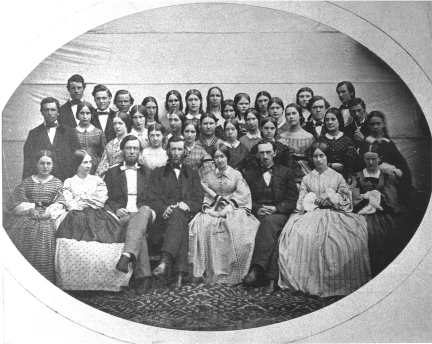
Students and Faculty, the Westfield State Normal School, circa 1860