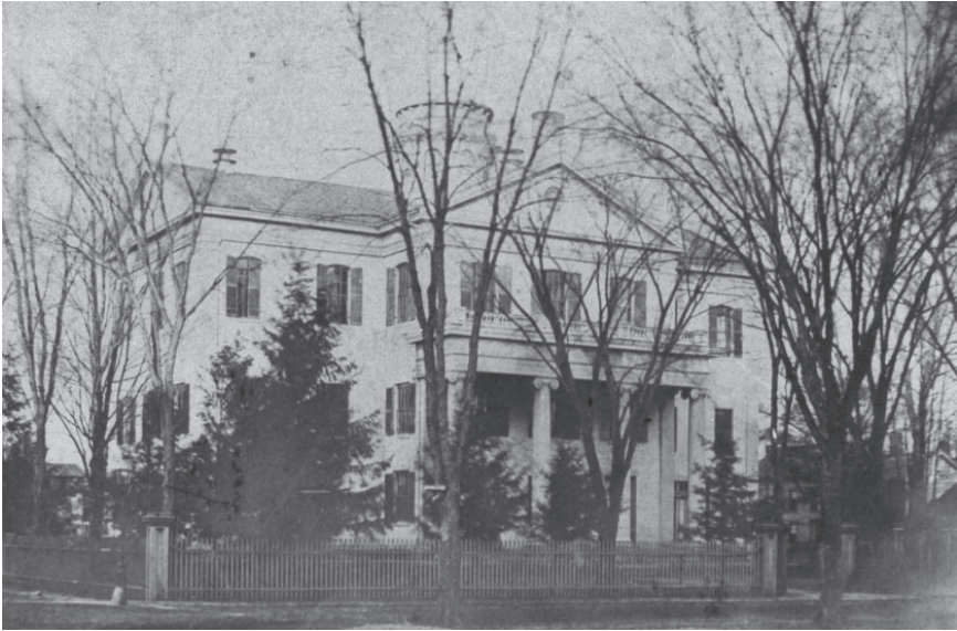
Westfield State Normal School, 1846–1892

educating women to become teachers, Mann assured the public that schools like Westfield would not duplicate the work of colleges and universities, but rather drill future teachers in the subjects they would teach, verify that they were of “good moral character,” and teach them how to keep order in a school. 11