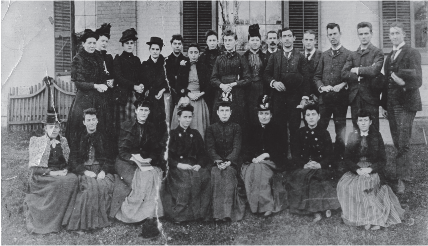
Students Graduating in 1889