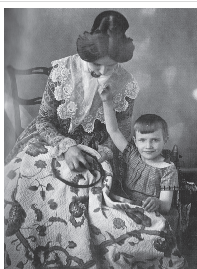
Learning to Sew, c. 1898