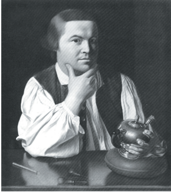
Portrait of Paul Revere John Singleton Copley, c. 1768-70

Copley is widely considered the greatest and most influential painter in colonial America, producing about 350 works of art. His Boston portraits show a thorough knowledge of his New England models, and his talent as a draftsman and colorist produced pictures of aristocratic elegance and grace. With his startling likenesses of persons and things, he came to define a realist art tradition in America.