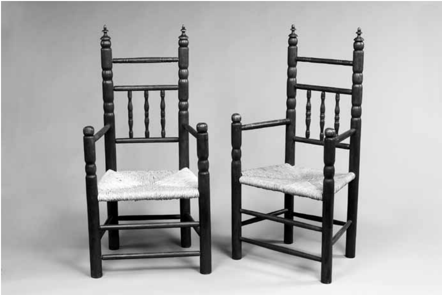
Pair of Great Chairs, possibly Springfield, Massachusetts, c. 1680. Ash and modern rush seats. Museum Collections Fund, 2006.4.1,2.

Reserved for the use of male heads of the household and guests of equal or higher standing, great chairs served two purposes: as seating and as a symbol of the sitter's status. The only matched pair known to have survived together from seventeenth-century colonial America, these chairs were acquired from descendants of the Bliss family in Longmeadow, Massachusetts. A wood turner probably made them as part of a larger set that may have included ten or twelve side chairs, all of which would have been supplied with plump, down-filled cushions.