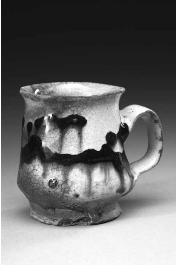
Cup, The Midlands, England, 1700-1720. Slip-decorated earthenware. 68.016.