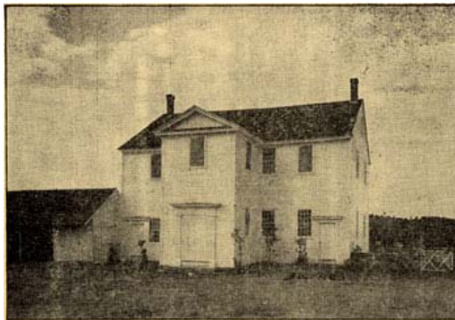
Figure 1. Pelham Town Hall. In original published edition, photographed by Lincoln W. Barnes. Courtesy of Pelham Free Public Library. In digitized version, image from Pocumtuck Valley Memorial Association.