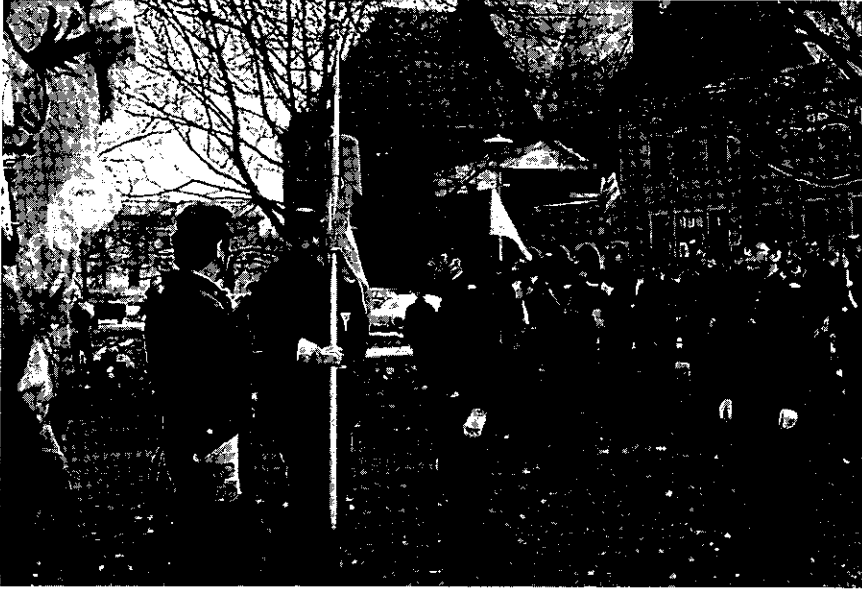
November 19, 1988 Ceremony held at the Connecticut Valley Historical Museum, Springfield, Massachusetts

flag consisting of three bars and ten stars, it was presumed to date from May of 1861, after North Carolina became the tenth state to