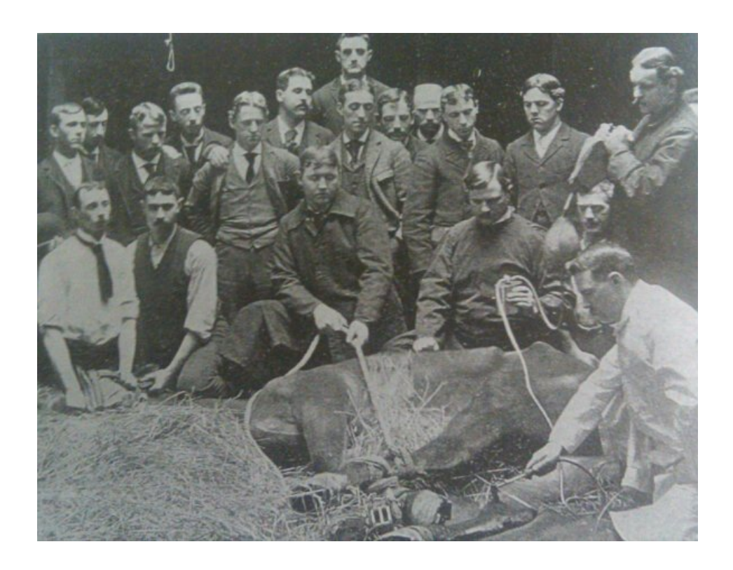
Figure 3. Students at the Harvard School of Veterinary Medicine observing the application of a continuous heat cautery to the rear leg of Most graduates of this school practiced in a horse, about 1892. Massachusetts. In addition, Harvard alumni led the political struggle to register and regulate the Commonwealth's veterinary profession. Langdon Frothingham, an 1889 graduate, chaired the registration Board from its inception in 1904 until his death in 1935. The Harvard students were not without a sense of humor, as indicated by the noose hanging at the back of the class. Reproduced from Descriptive Circular of the School of Veterinary Medicine of Harvard University (1892 or 1893). Courtesy of the Harvard University Archives.