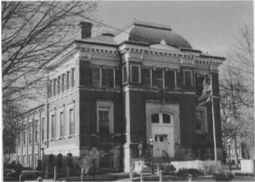
Figure 1. Memorial Hall (Jill Walton 2004)