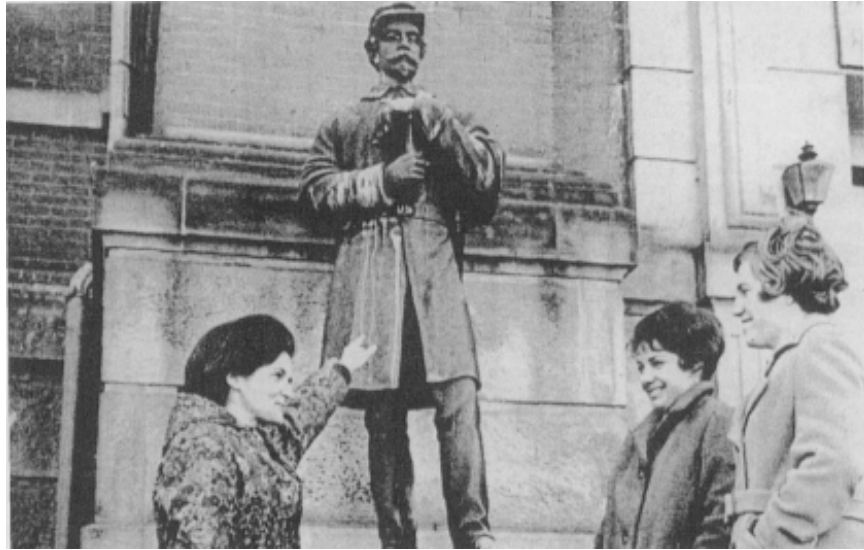
Figure 4. Memorial Hall Soldier Statue. ( Daily Hampshire Gazette , December 13, 1968)