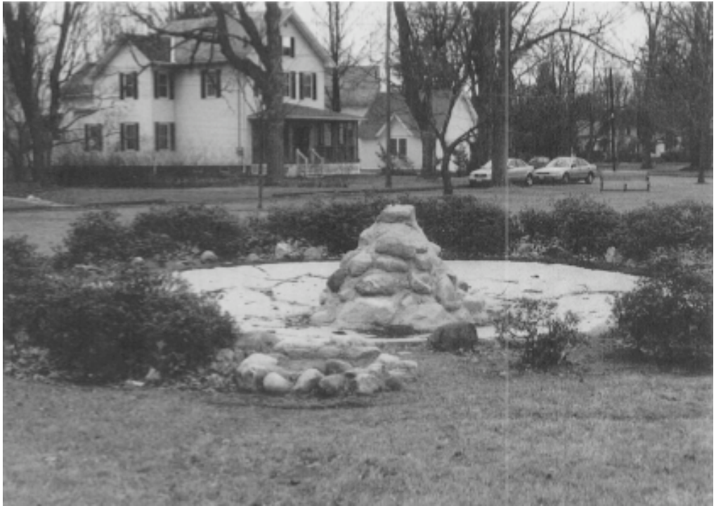
Figure 7. Fountain at Florence (Jill Walton, 2003).