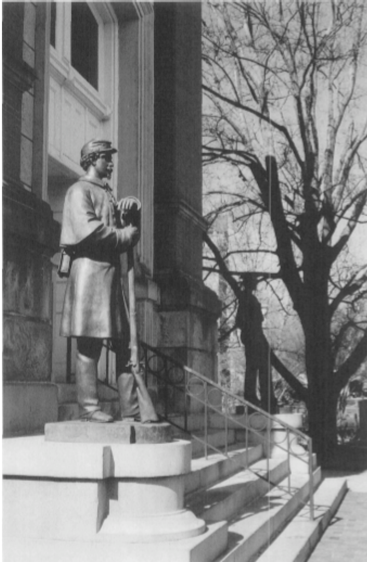
Figure 2. Memorial Hall Statues (Jill Walton 2004)