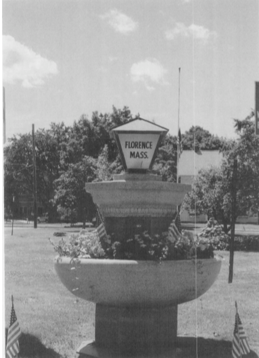
Figure 9. The Maine Fountain. (Jill Walton, 2004).