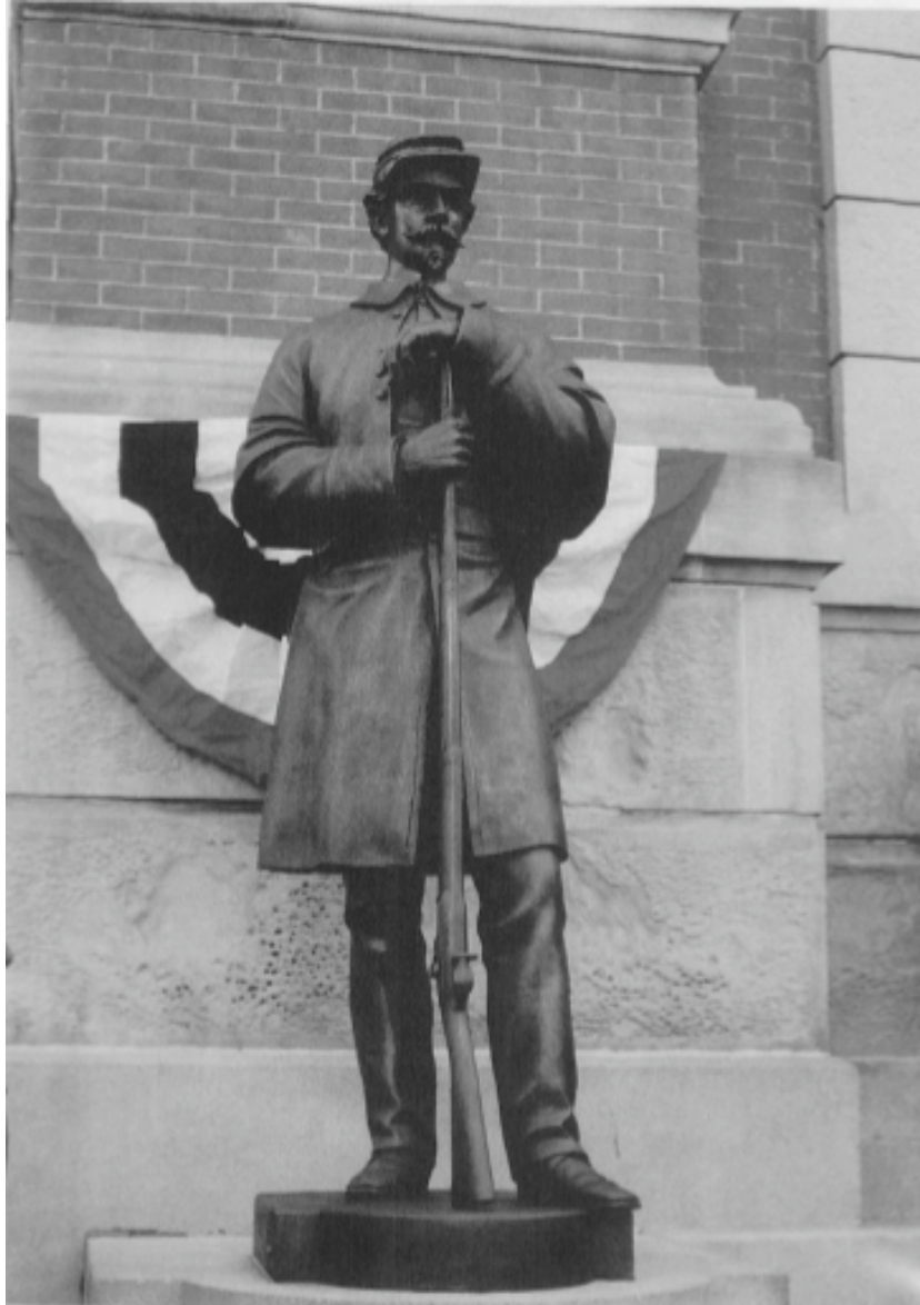
Figure 5. Civil War Memorial Soldier Statue (Jill Walton, 1992).