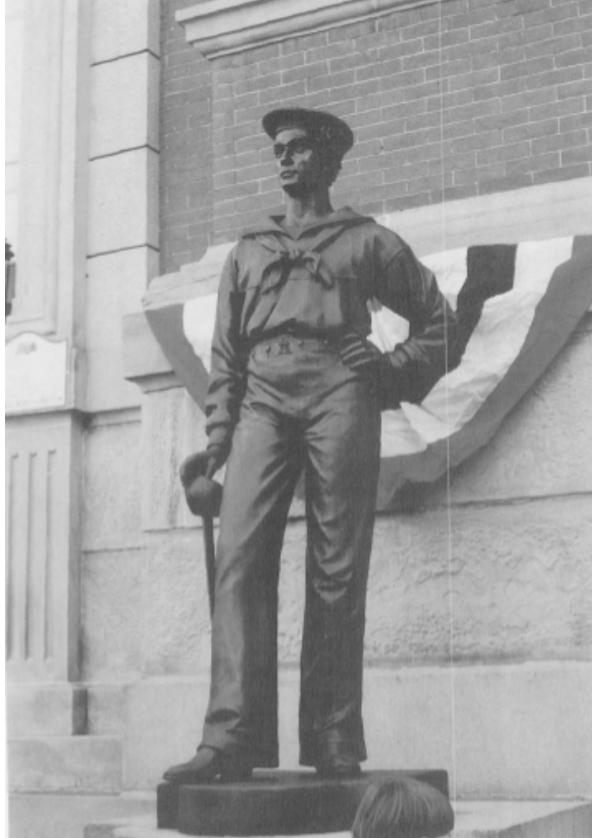
Figure 6. Civil War Memorial Sailor Statue (Jill Walton, 1992).