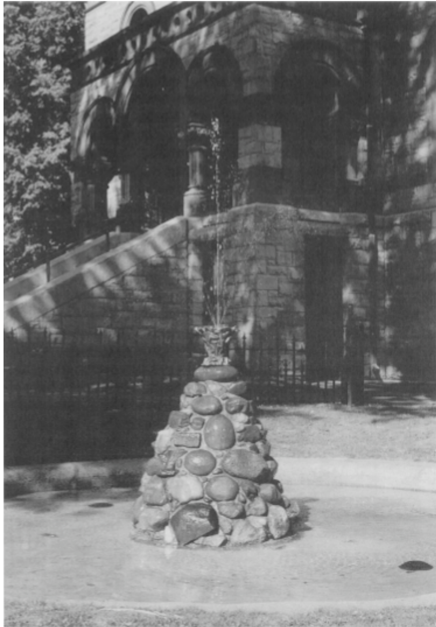
Figure 8. Hampshire County Courthouse Fountain (Jill Walton, 1998).