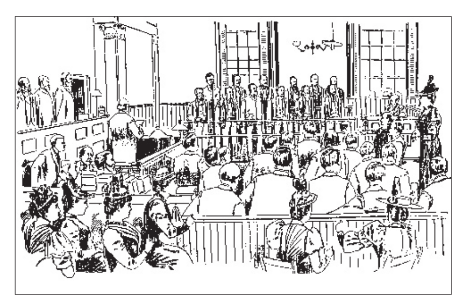
Courtroom Scene, June 20, 1893

According to the University of Massachusetts' online Lizzie Borden / Fall River Case Study project (ccbit.cs.umass.edu/lizzie/intro/home), "the New York Times , like other major metropolitan newspapers at the turn of the century, covered the trial throughout its duration. This trial was one of the first to be covered by the AP press, so it was covered across the country — even by newspapers which did not have staff present at the trial."