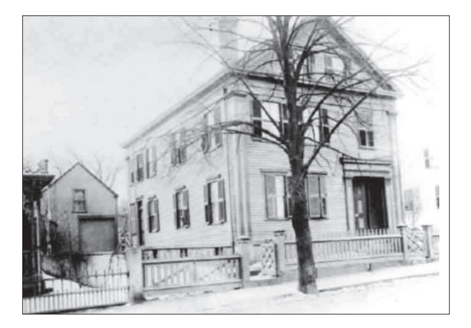
The Borden Home in Fall River, 1892

You cannot fail, I think, to be impressed in this respect with what will appear as to the method of living of this family. It will appear later on in the evidence that, although they occupied the same household, there was built up between them by locks and bolts and bars, almost an impassable wall.<sup>9</sup>