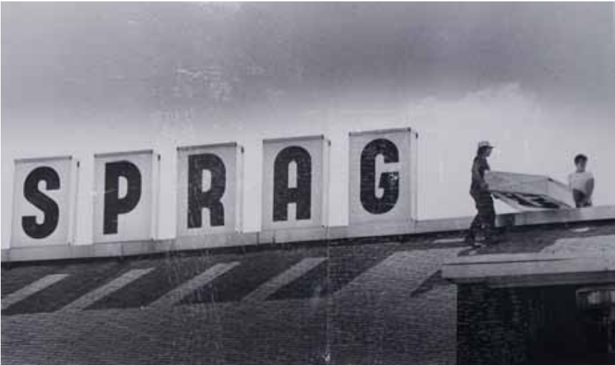
The Sprague plant closed its doors in 1986 when the company’s owners, Penn Central Corporation, moved operations out of North Adams.