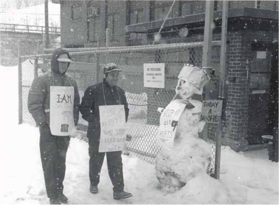
Strikers picket during a cold Berkshire winter. Here two picketers illustrate the unity workers demonstrated. The man on the right, a member of IUE #200, the production workers union, carries a sign supporting the machinists (I AM #1794) and the office and technical workers union (AFTE #101).