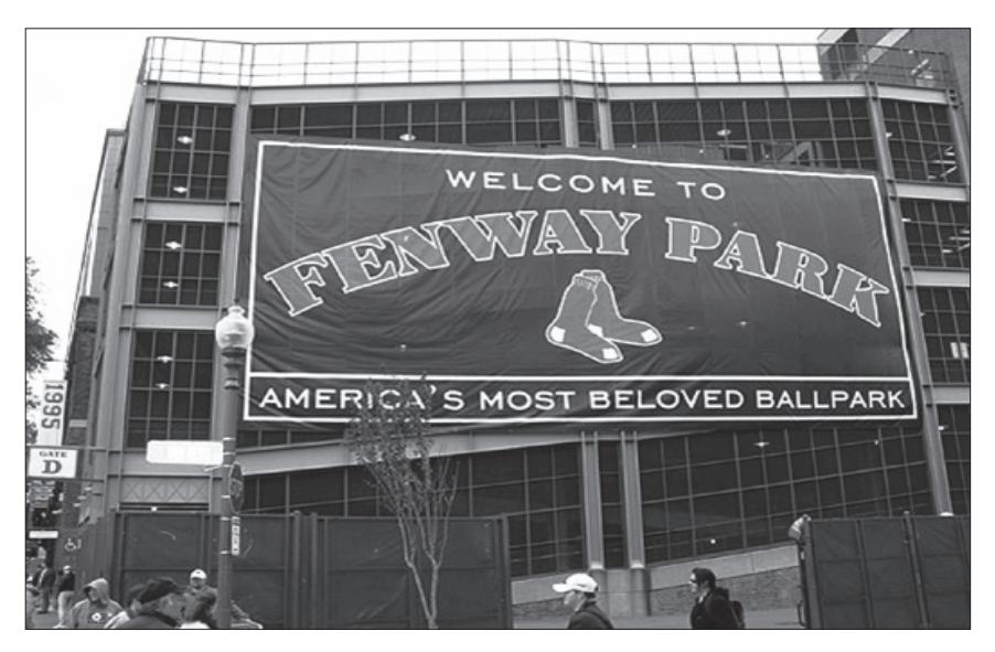
Fenway Park, opening day, 2005. The Red Sox beat the New York Yankees 8–1.