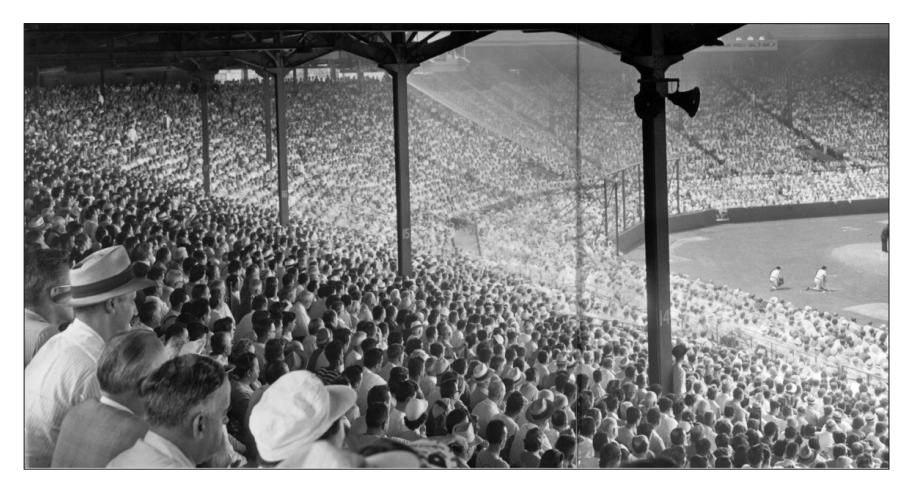
Fenway Park teems with fans for a 1951 matchup with the New York Yankees. The Sox won.