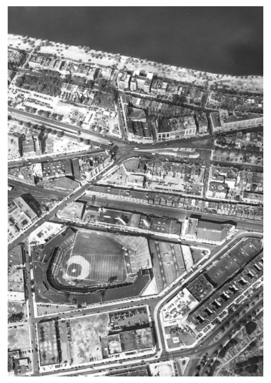
Kenmore Square, c. 1950s

Kenmore Square, center of the photo, with its best-known feature, Fenway Park, lower center. The photo shows Fenway lined for football.