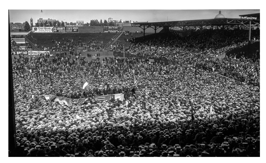
Rally for Irish Independence, 1919

The Boston Red Sox won the World Series at Fenway Park five times: in 1912, 1915, 1916, 1918, but then not again for another 95 years, until 2013. The Red Sox also won the World Series in 2004 and 2007, but the clinching games of those World Series were not played at Fenway Park. Despite this, the championship in 2004 was of special significance to the Fenway Faithful because it broke an 86-year championship drought. To fans, this meant that