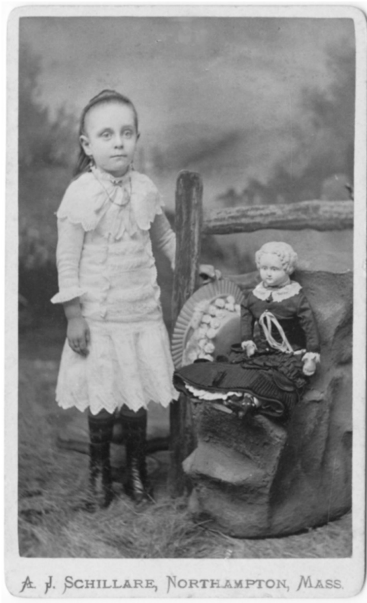
Unidentified Girl, Prescott, MA; 1881–93.