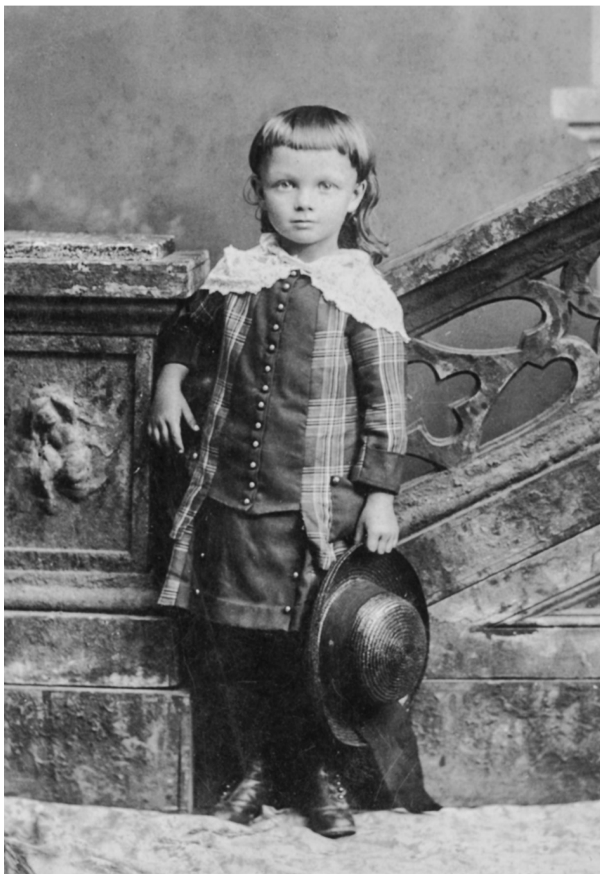
Unidentified Boy, Greenwich, MA; 1885–90.