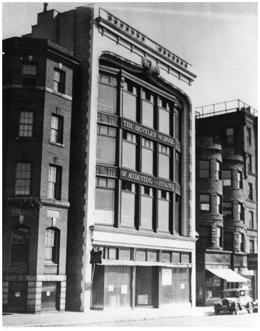
The Bentley School's Main Building, 921 Boylston Street, Boston

Before the renovation of 915 Boylston Street (which now belongs to the Berklee College of Music), Bentley's students had to go to the back of the building, enter the basement, and climb up a narrow back stairway to their classrooms. This entry into the building was hardly auspicious, and the students were glad when Bentley added the second front door, through which