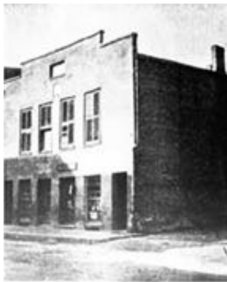
Sanford Street Church, c. 1911