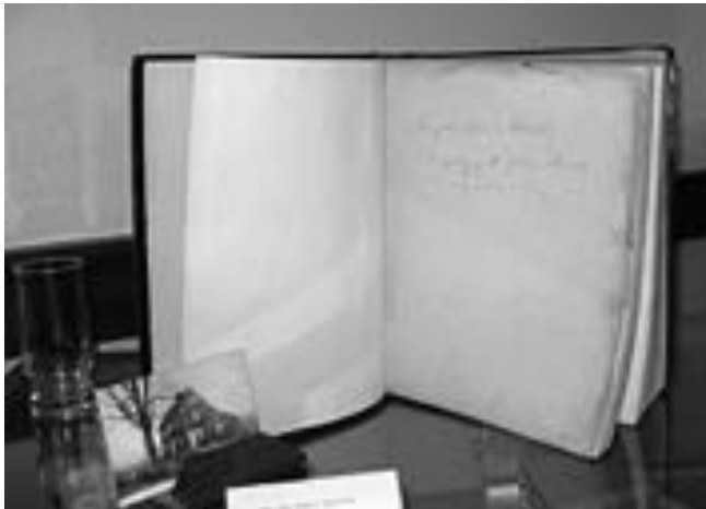
John Brown's bible owned by St. John's Congregational Church (formerly Sanford Street "Free" Church)