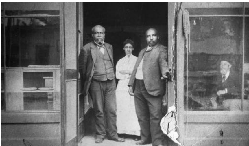
African American Leaders, c. 1864

When he was here he was smooth-faced and had black, heavy hair brushed straight up from his forehead. He always dressed in plain browns, something like a Quaker. He wasn't tall, nor anything of a giant, as some represent, and he wasn't at all fierce or crazy looking. He was medium in height and he was quiet and agreeable to talk with. He was a gentleman and a Christian. 30