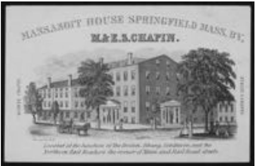
Massasoit House, Site on the Underground Railroad