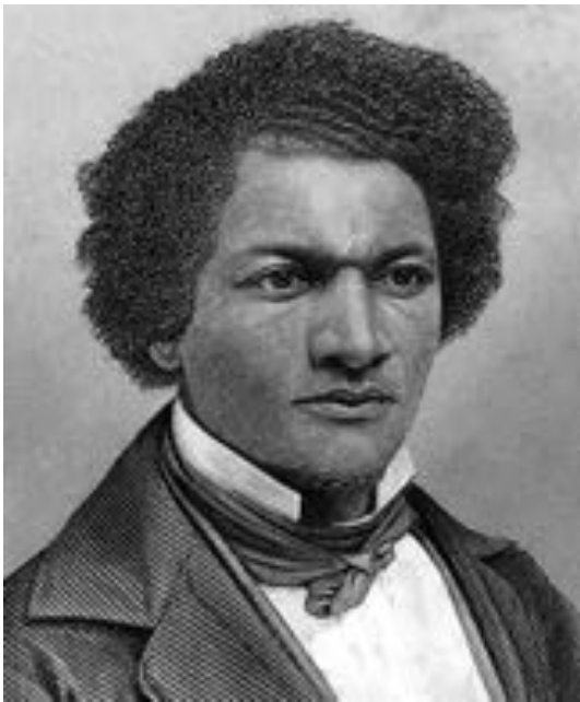
Frederick Douglass (1818-1895), c. 1850