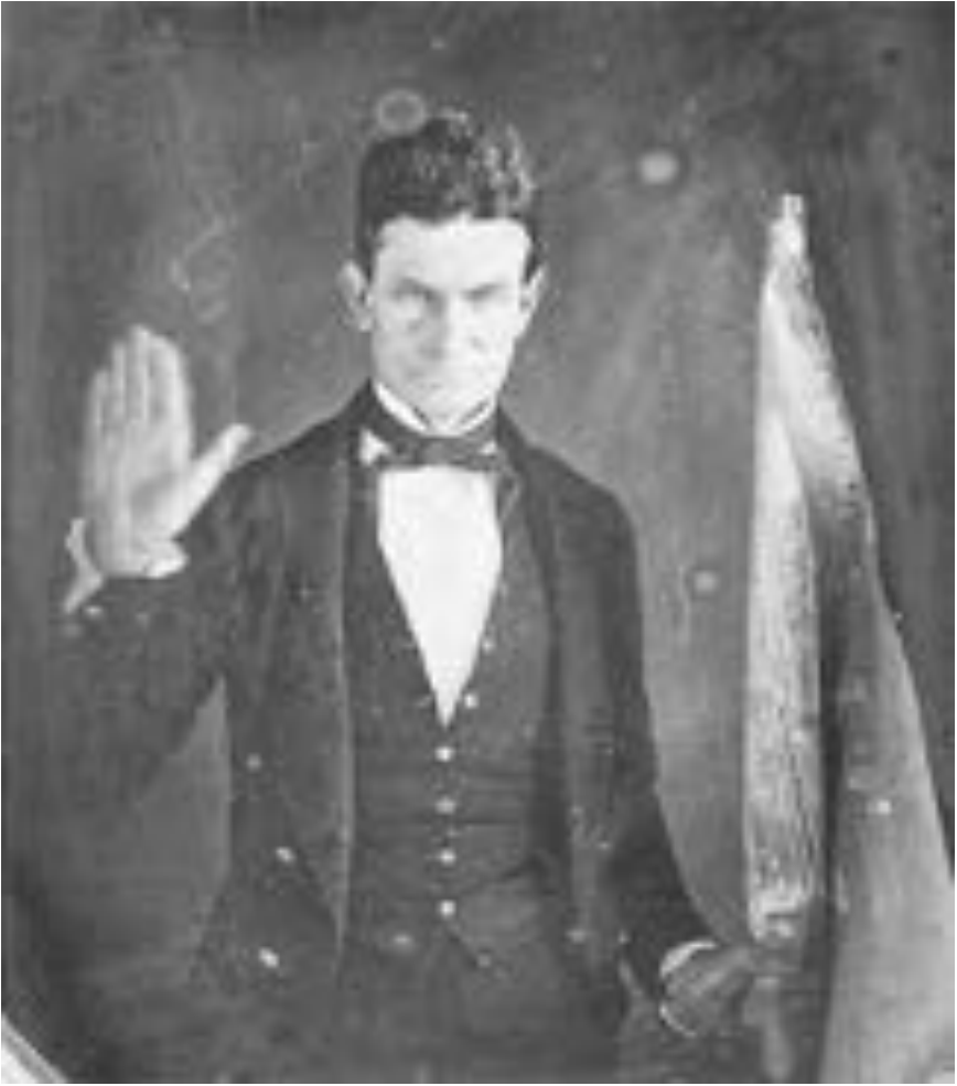
John Brown (1800-1859)

Daguerreotype by Augustus Washington, c. 1848.