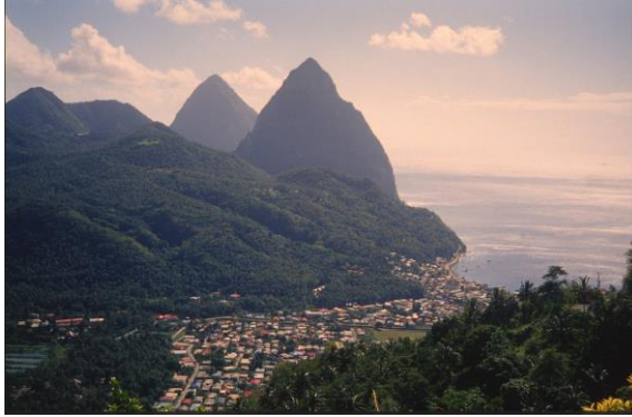
Grand Pitons, St Lucia

How come we have fire and ice on the planet?