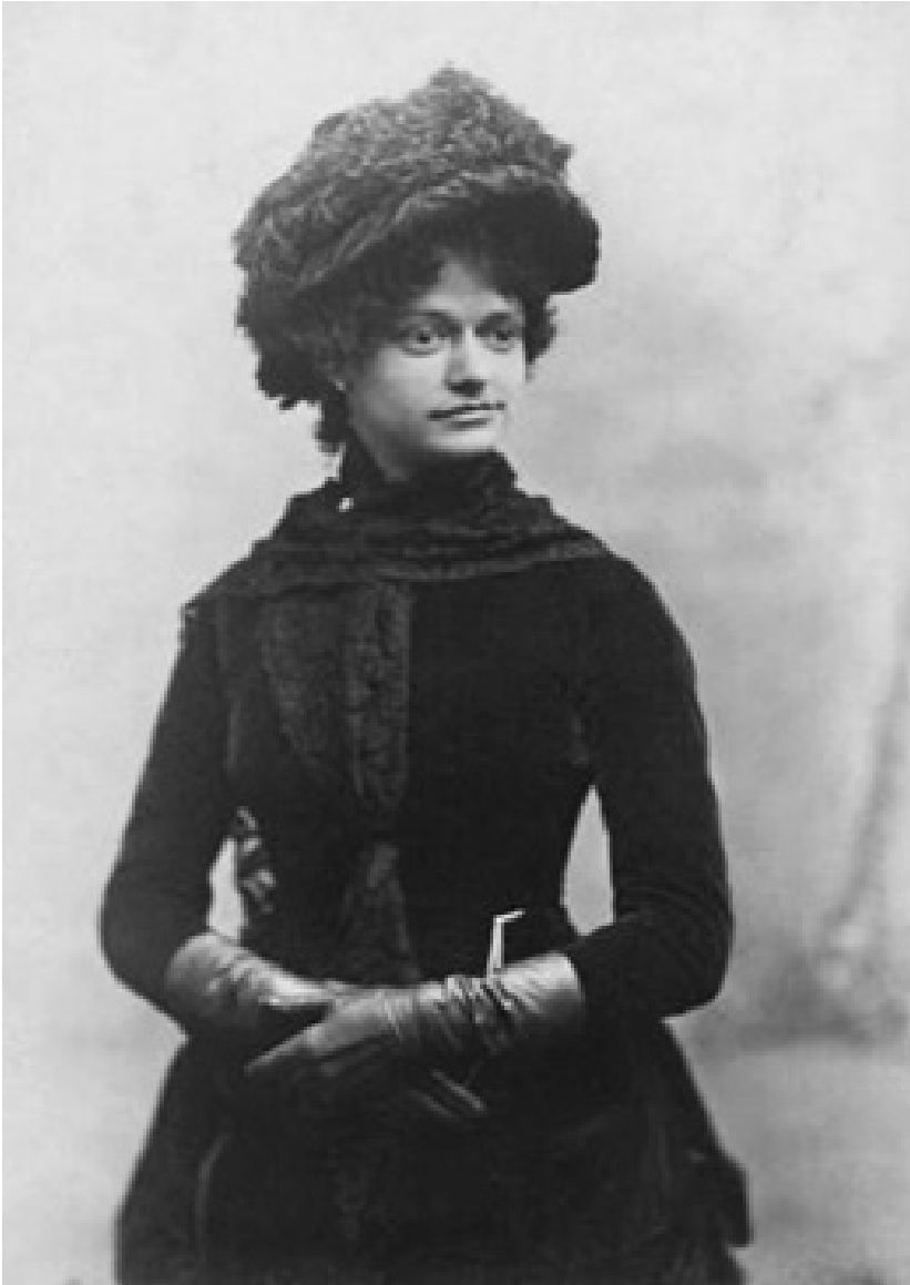
Mabel Loomis Todd (1856–1932)