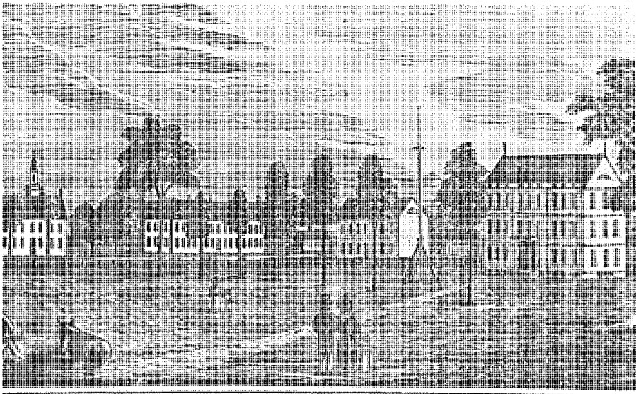
Western view of the Armory Buildings, Springfield.