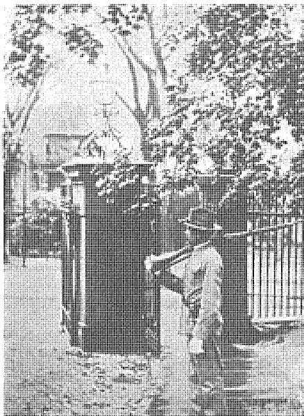
"Soldier on guard at the Springfield Armory."

Throughout the war there was a fear of sabotage, especially since newspapers were publishing how many arms could be produced each month. In 1864 an attempt was made by two men who had somehow gained entrance to the arsenal grounds and persuaded the keeper to let them climb the tower of the Main Arsenal to see the panoramic view. After a short stay up there, they came down and left the grounds. Later, while making his rounds, a night watchman discovered in the tower clock a bundle wrapped in newspapers. He was very suspicious and turned it over to his superiors. 52 "The Infernal Machine" was a bomb made of iron. A pencilled inscription upon the newspaper wrapping indicated that they were from Canada. 53 As it turned out this was the only attempt to sabotage work at the Armory. By the end of the war the Armory had distinguished itself with honor and had withstood the pressure placed upon it by the loss of the Government's other arsenal at Harper's Ferry. Not only did it serve the country, but it also helped Springfield. "It was during these years (1861-1865) that the population of the city increased enormously. Many came to the city to secure employment at the Armory. When the arsenal was curtailed during the close of the war, many of the discharged employees established small industries and businesses." 54