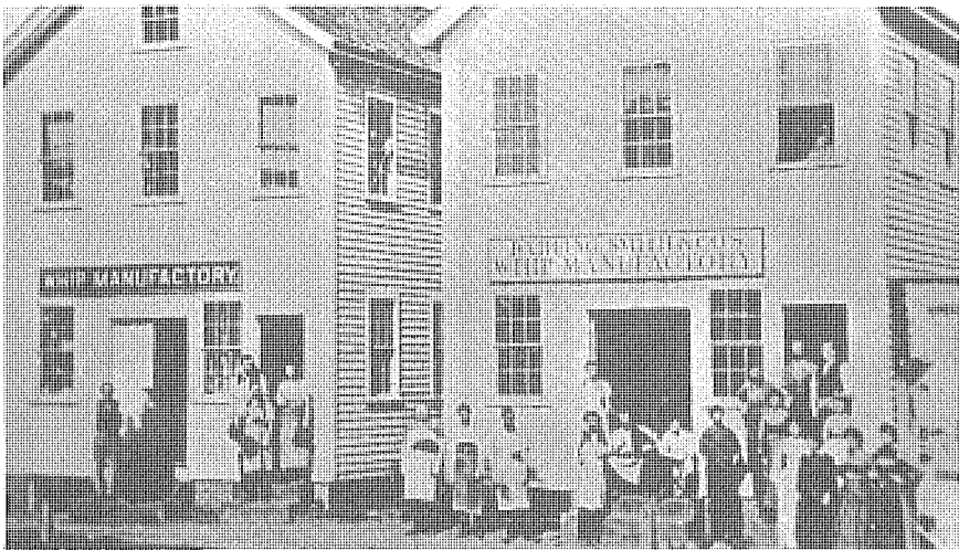
WHIP FACTORY, from Westfield's Quarter Millennial Anniversary Program (1919).