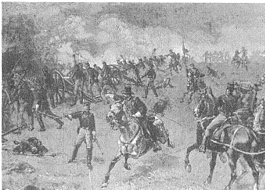
BATTLE SCENE, from Century War Book (New York, 1894).

April of 1865 saw a variety of emotions. News of the surrender of General Lee was greeted with great jubilation. "The Democrats seemed joyous and at noon the Democratic cannon was fired in connection with the one owned by the Republicans." 96 Two days later Lincoln's assassination cast a pall of gloom over the town. Business establishments were draped in mourning and "men were seen walking the streets, seemingly insensible to external objects." Stores were closed on the afternoon of his death, and the church bells sounded. 97 For the following month, the News Letter enclosed the second page of each issue in the black borders of mourning, and speculation was voiced about a connection between John Wilkes Booth and the leaders of the Confederacy. "Southern chivalry hung Union women in Eastern Tennessee, shot our wounded soldiers in ambulances, starved them in prison, and assassinated President Lincoln." 98 The progress of the funeral train was followed, and all the local churches abandoned their sectarian differences in a united funeral service for the President at the First Congregational Church. 99