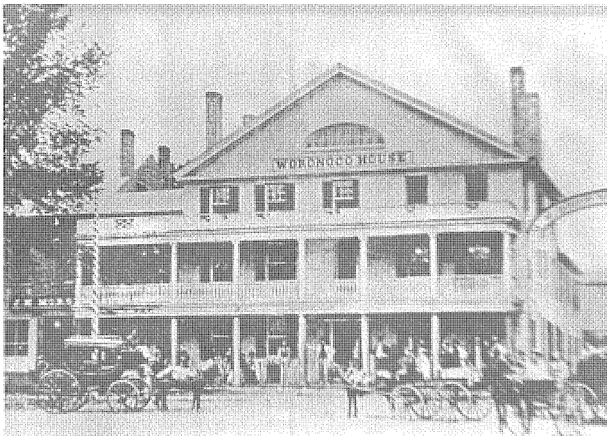
WORONOCO HOTEL, from Westfield's Quarter Millennial Anniversary Program (1919).

Abraham Lincoln had split thirty years before. This Lincoln drum was displayed in the newly established Republican club rooms. 13