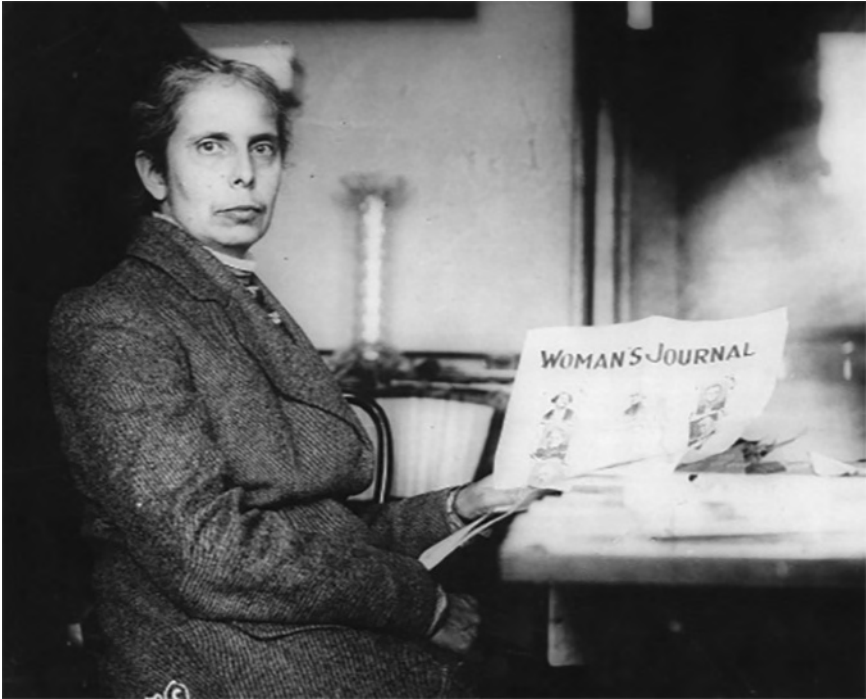
Alice Stone Blackwell