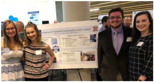
Students presented their research on WSU's community engagement at the Pathways to Excellence Gala.

There are many benefits to place-based learning, and it has changed my college career for the better. Academically, place-based learning helps to break away from the sometimes monotonous textbookbased courses, and providing a different type of learning helps to change the way a person thinks. Professionally, place-based learning helps to develop relationships with community members that could lead to internship, volunteer, or job opportunities. And socially, through developing communication skills and forming connections with the location that they are studying, students can help strengthen the connection between the university and the community. My placebased learning courses have helped me to connect with the city and its members. I feel more confident to call Westfield my home away from home.