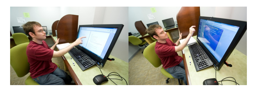
Student using touch screen in assistive technology lab.