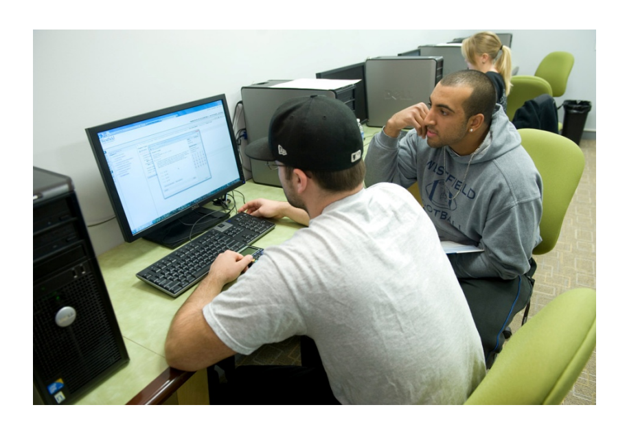
Student with a tutor in the Banacos computer lab.