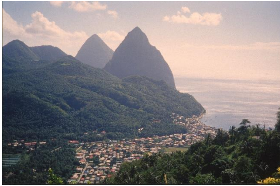
Grand Pitons, St Lucia

How come we have fire and ice on the planet?